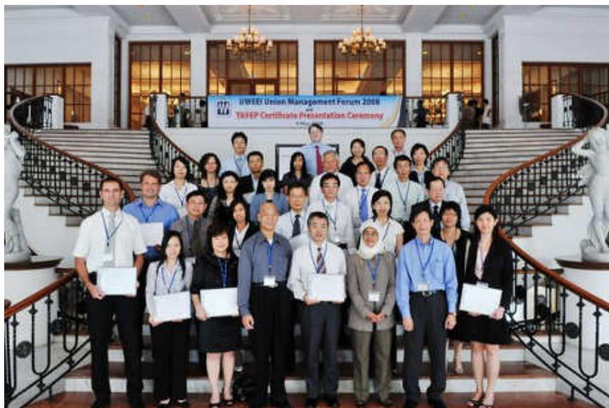
53 UWEEI branches had pledged their support for FEP. 39 companies pledged their commitment during the annual Union-Management forum.