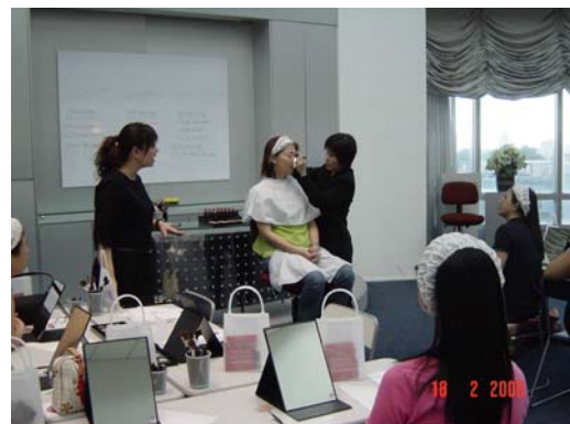
The trainer demonstrating with the help of a participant.

The response for the make up course was overwhelming! Over 60 members signed up for the course within the first few days of registration. The two hours course conducted by Shiseido provided the members with a basic understanding of make-up. The girls also had the opportunity of practicing what they have learnt on themselves. Many also gained useful make-up tips from the trainers. One member from TCL Thomson said smiling, "It's very good. I have learnt a lot from the course."